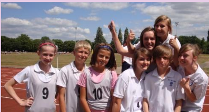
Year 7 Athletics Competitors

A number of students competed exceptionally hard in their events at the Peterborough School Athletics Trials which took place at the Embankment Athletic Track in Peterborough. These students were successful in being selected to represent Peterborough Schools at the Cambridgeshire Schools Track and Field Championships to be held at Cambridge.