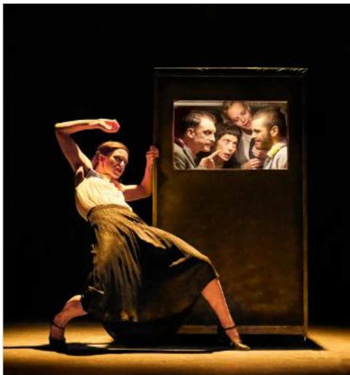
Gecko 'The Wedding'

Create a presentation ready for September (can be power point)